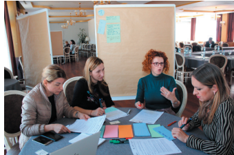
Specific ToT for trainers from B&H, Albania and Montenegro