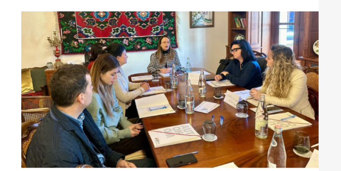
Building Capacity on Capital Infrastructure Investment Projects in Albania