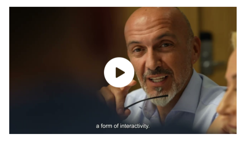
RCDN: Building Capacity for Better Water and Sanitation Services (Generic Training of Trainers)