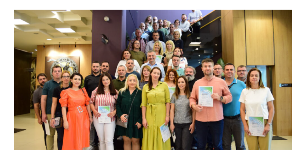
RCDN Invests in Building Training Expertise through Generic ToT in Tirana