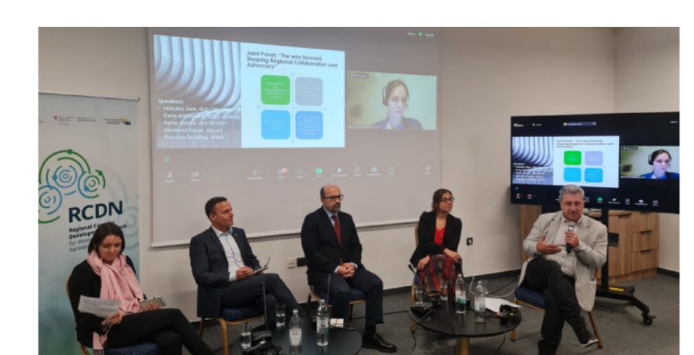
RCDN+ 2nd PAB Meeting and Strategic Networking Event Drive Regional Collaboration Forward