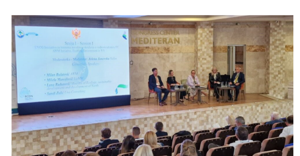
Strengthening Regional Water Sector Collaboration at the 5th Montenegro Water Conference